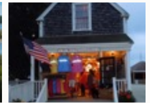
Original Black Dog