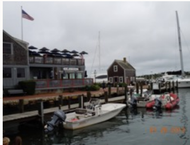
Dine on beautiful Edgartown Harbor

SCC is pleased to offer this lovely Martha's Vineyard Cottage. The cottage has three bedrooms, two full bathrooms, cozy living room and a complete kitchen and dining, an outdoor deck and is strategically located just outside Oak Bluffs on County Road and convenient to Edgartown, Chappaquiddic, and all the Island's beaches, sights and restaurants. Can accommodate up to six comfortably. Sorry, no pets. $1500 Value.