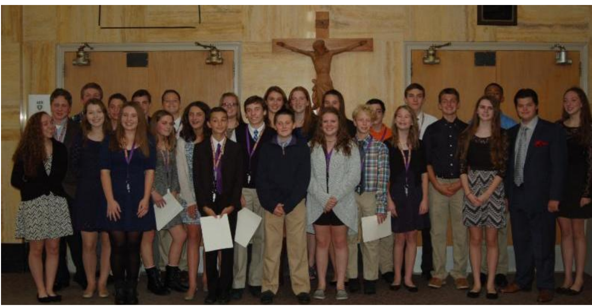
National Junior Honor Society Members!