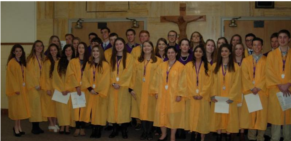
National Honor Society Members!